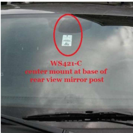
WS421-C center mount at base of rear view mirror post

The WS421 series tags are designed to be mounted in a vertical orientation on the inside of the vehicle's windshield. This tag is tuned to the dielectric properties of the windshields glass so proper performance is achieved when adhered to the windshields glass. Testing is recommended and can be accomplished by taping (painters' tape is recommended) the tag on a temporary basis only. The WS421 must be mounted at least two inches from the metal support posts on either side/bottom of the windshield. The preferred placement is at the bottom/left (driver's side) of the windshield to avoid antennas or tinting at the top of the windshield and to also ensure that the driver's view of the roadway is not obstructed! This mounting position is always recommended when the Reader is positioned on the left side of the travel lane... If the Reader is mounted on the right side of the travel lane, this tag mounting position can be duplicated on the right (passenger) side of the windshield.